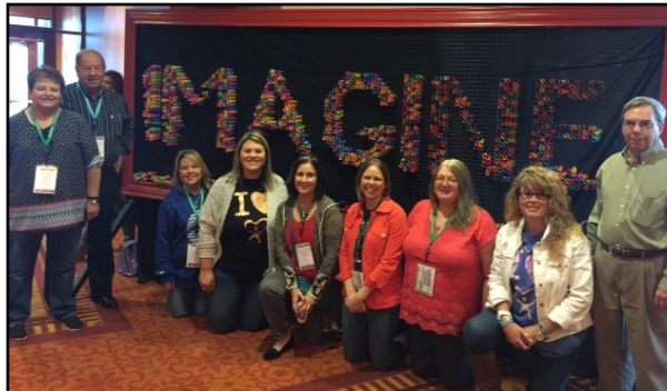
CASA staff and volunteers enjoyed the Texas CASA Conference, entitled "Imagine", which occurred Nov. 5-7 in San Marcos.