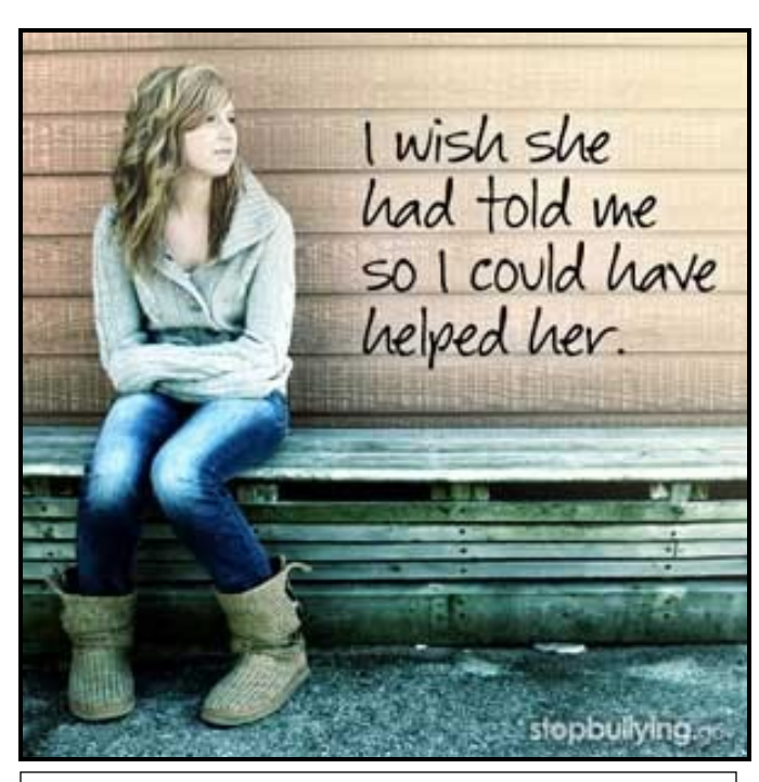
What can we do to help prevent bullying amongst our youth? Find out more on page 2 of this issue.