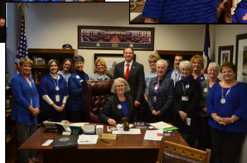
Above: State Representative Jimmie Don Aycock meets with several constituents from CASA for the Highland Lakes Area during CASA Day at the Capitol in 2013.