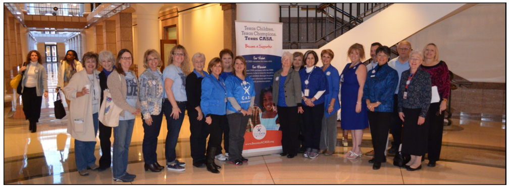
Above: Group Photo of CASA for the Highland Lakes Area at CASA Day at the Capitol in 2013.

Contact the CASA office and we will be happy to come and share what we do. We have spoken to church groups, civic organizations, Bible study groups and social groups and we would LOVE to do more! No group is too small!!!! We can also help you plan a "Party with a Purpose"! Contact us to see how you can help us spread the word about CASA and how we help children in need.